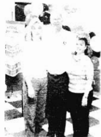
Elvis was in the building.

Moose Legion Breakfast Sunday 9:00 am until Noon May 22 June 26