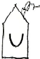
The House that love built...

Old man winter has finally departed. Spring is in the air. Don't forget to pop those tops for the Ronald McDonald House.